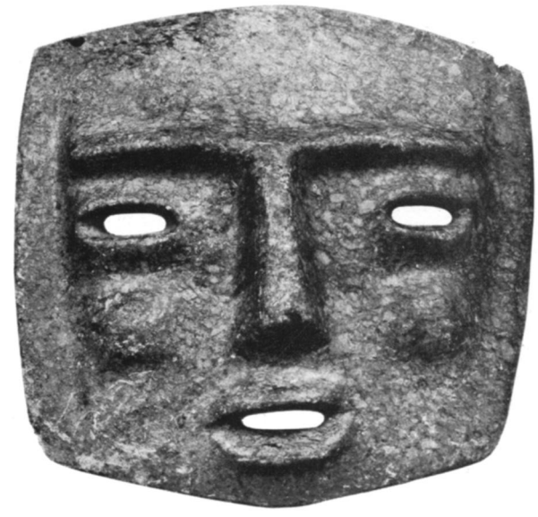
TOLTEC MASK OF STONE. ROBERT ALEXANDER WALLER MEMORIAL FUND

ΗE Art Institute Members' Series given at the Goodman Theatre last season proved s o popular that many members were dis-