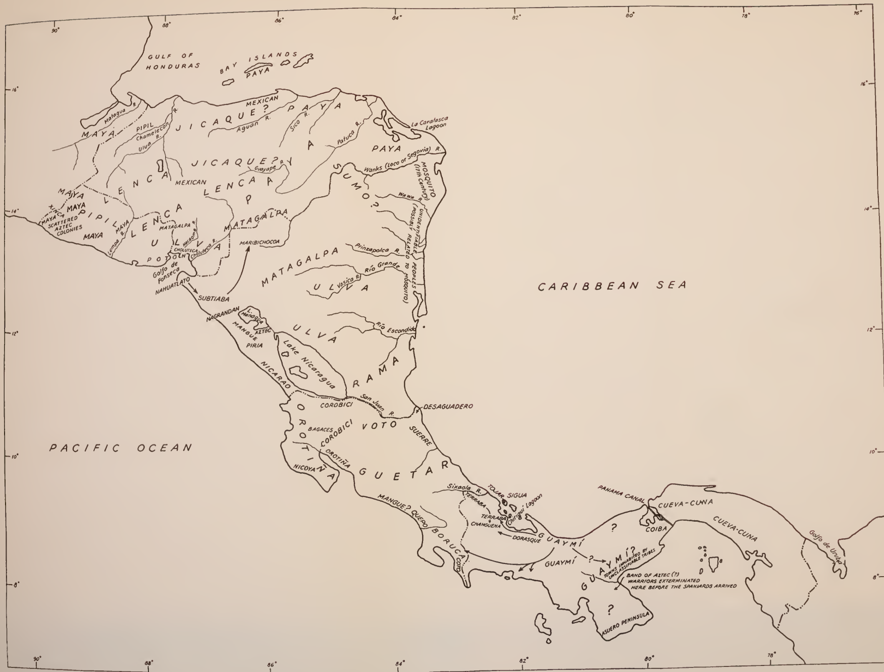
MAP 2.—The native tribes of Central America. (Prepared by Frederick Johnson.)