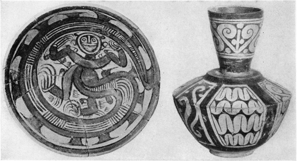
FIG. 1.—POLYCHROME PLATE AND CARAFE. SITIO CONTE, COCLÉ, PANAMÁ