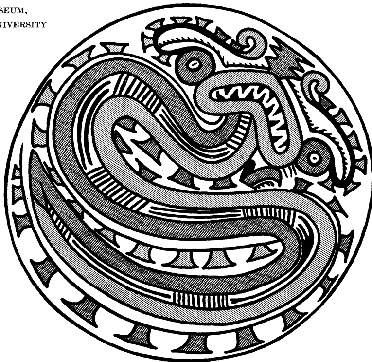
FIG. 5.—DESIGN FROM PLATE PAINTED IN RED, PURPLE AND BLACK. SITIO CONTE, COCLÉ, PANAMÁ. WIDTH, 11½ IN.