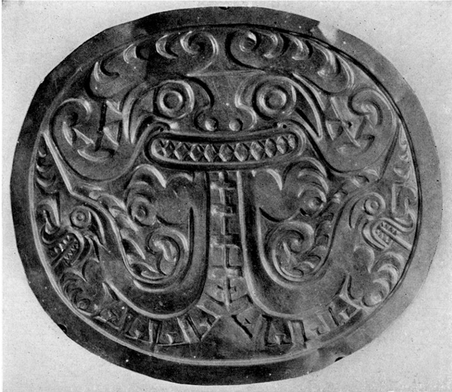
FIG. 3.—GOLD PLAQUE. SITIO CONTE, COCLÉ, PANAMÁ. WIDTH, 11\frac{3}{4} IN.

Graves of another type were of greater size and age. They contained two bodies, male and female, buried in an extended position, characteristically face downward, head to the northeast and arms flexed. Jewelry of stone, bone, copper or gold often