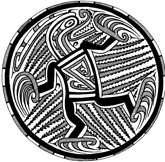
FIG. 4.—POTTERY BOWL PAINTED BLACK, BLUE AND TWO SHADES OF RED. SITIO CONTE, COCLÉ, PANAMÁ. WIDTH, 8 IN.

that there was not enough room for them all on the floor of the grave and they had been piled up one over the other. Furthermore, funeral furnishings were introduced in such large quantities that they completely roofed over the dead. There usually were at least 200 pottery vessels—plates, bowls, carafes, bottles and jars—as well as all kinds of weapons and tools. Occasional vacant spaces probably once were filled with perishable materials such as provisions, fabrics or objects of wood.