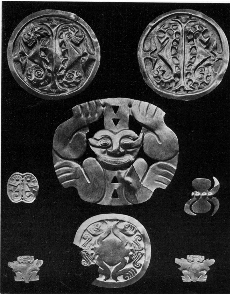
FIG. 2.—GOLD PLAQUES FOR ATTACHMENT TO CLOTHING. SITIO CONTE, COCLÉ, PANAMÁ. WIDTH OF d , 5\frac{1}{8} IN.