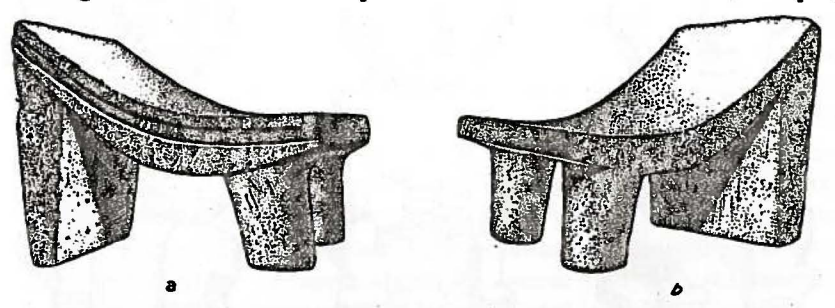
FIG. 1-METATES FROM HONDURAS AND THE ANTILLES

The Highland region as we have seen, shares common characteristics in stone and pottery with the Chiriquí. Not such a close relationship existed with the Pacific area. However, Highland polychrome styles assimilated shapes and patterns from the Pacific area. Glass found in conjunction with typical Highland material definitely establishes its contact with the Conquest.