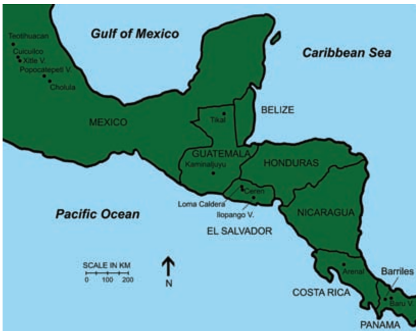
2.1. Map of Mexico and Central America, with archaeological sites and volcanoes indicated. Map by Payson Sheets.

km 3 of tephra) and were thus evaluated as “cataclysmic.” Volcanologists have documented many more eruptions of Arenal Volcano, and a total of thirty-two eruptions are listed by the Smithsonian, beginning 7,000 years ago and ending with the present ongoing eruption (figure 2.2). Some of them were from the adjoining cone of Cerro Chato. Cerro Chato and Arenal share the same magma chamber and for our purposes here can be considered the same source.