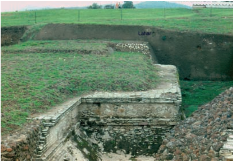
2.6. Cholula, Puebla, Mexico. The talud-tablero architecture of a one-tier platform was buried by a deep lahar from Popocatepetl Volcano. The lahar is labeled in the middle ground.

ductive lands in Puebla has been verified by excavations of the communities around Tetimpa by Patricia Plunket and Gabriela Uruñuela (Evans 2008: 250). Surely many immigrants headed downhill farther east to the big city of Cholula (ibid.: 251) and may have moved into that metropolis, likely at the lowest level of the social strata. The fact that talud-tablero architecture had been practiced for many decades in Tetimpa and then suddenly showed up in Teotihuacan at about the same time as the eruption suggests that many refugees may have fled from Puebla to that great Basin of Mexico city and perhaps introduced talud-tablero architecture there. Many of them may have become local construction workers. But this is curious, as one would not expect refugees to introduce an architectural style into their host settlement that became the religious form henceforth. Following ecological recovery, some farmers apparently traveled back up to their land at Tetimpa for agricultural purposes and then returned to safer locations below. But the later eruption of Popocatepetl, during the ninth century, again devastated the slopes around Tetimpa (Plunket and Uruñuela 1998, 2002). I believe Cholula was devastated by a massive lahar , that is, a huge mudflow of largely wet volcanic ash (Sheets 2008: 180), following that second eruption (figure 2.6).