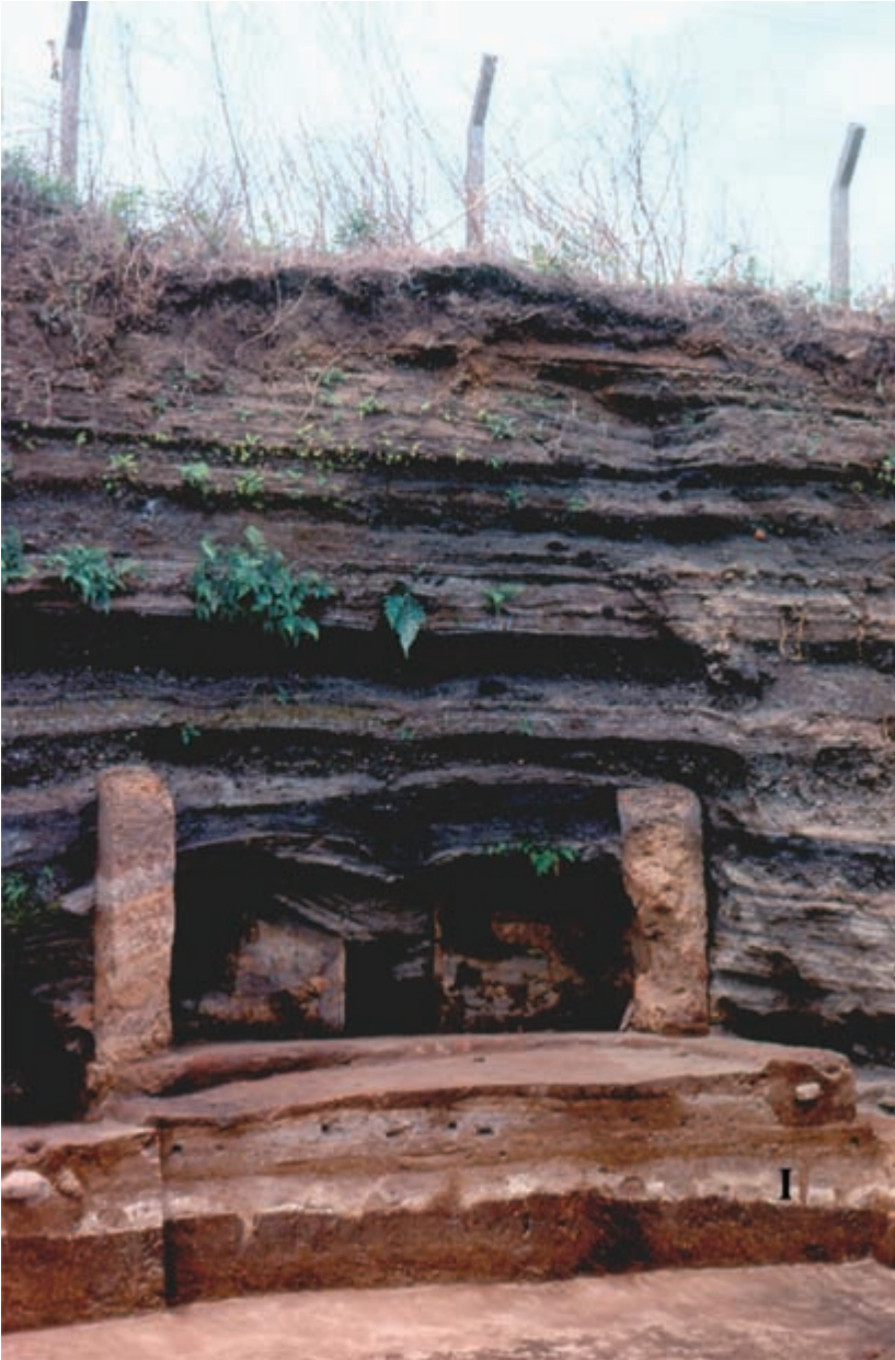
2.4. Structure 1 at the Ceren site, Zapotitan Valley, El Salvador. The valley and most of El Salvador were abandoned because of the fall of the Ilopango tephra ("I") and were reoccupied after a juvenile soil formed. Ceren residents lived and thrived for a few decades before being buried by 5 m of volcanic ash from the nearby Loma Caldera volcanic vent.