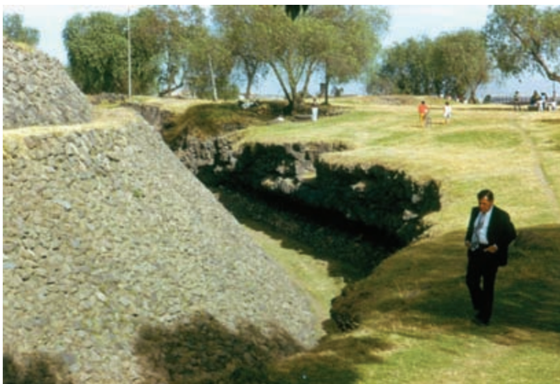
2.7. Cuicuilco, highland central Mexico. The main pyramid is on the left and was partially buried by the lava from Xitle Volcano, on the right. The lava was excavated away from the base of the pyramid, down to the pre-eruption ground surface.

a civic-ceremonial center with a large pyramid and perhaps 20,000 people (Evans 2008: 210). The eruption of Xitle Volcano (VEI 3) about 2,000 years ago deposited thick layers of tephra and lava, devastating and depopulating the southern basin for centuries (figure 2.7). Soils on top of the lavas have yet to recover, but they provide a scenic landscape for the modern Pedregal subdivision. Teotihuacan's rapid growth must have been, at least in part, a result of absorbing refugees from Cuicuilco and surrounding areas, in addition to those from Puebla. I suspect the refugees from both areas were absorbed into increasingly hierarchical Teotihuacan at the lowest level of society, as agricultural or construction workers or even as slaves.