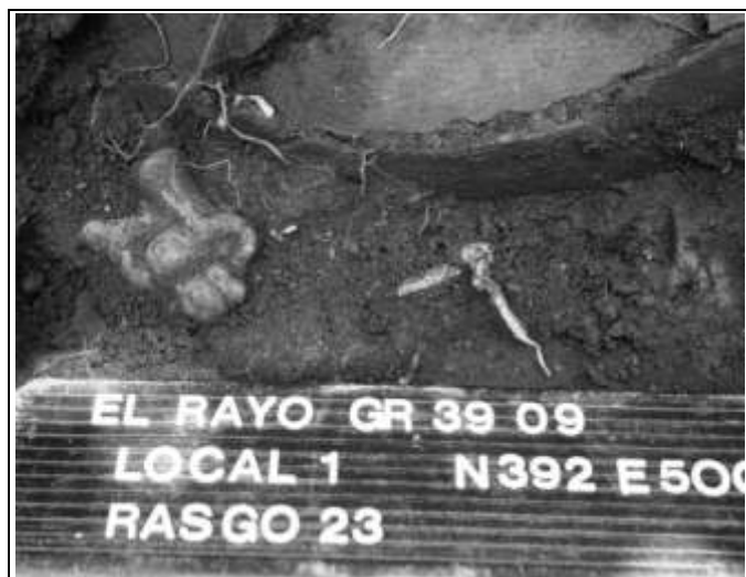
Figure 4. Area 1 Cluster 3, El Rayo. Upside down Hunchback figurine in situ.