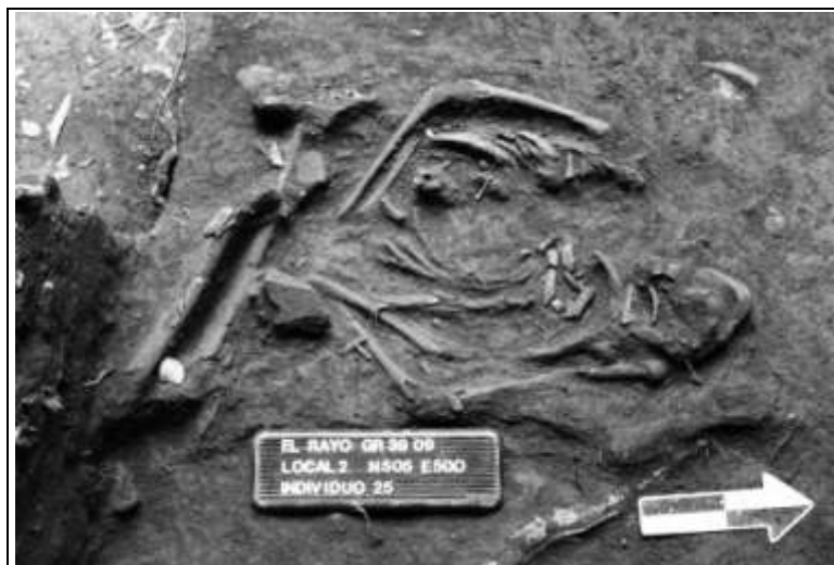
Figure 6. Area 2, El Rayo. Primary burial of elderly female.

strata, in association with late-Bagaces-period ceramics, while the lone mandible was found roughly 20 centimetres higher, in a transitional Bagaces-Sapoa layer.