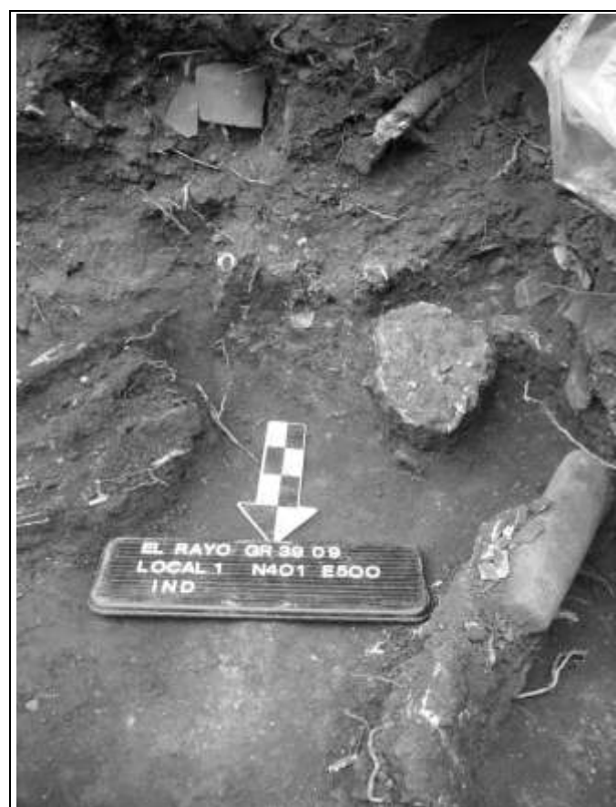
Figure 5. Area 1 Bottom of Cluster 4, El Rayo. Multiple sets of human remains, mano located on top of a long bone.

Excavations ended at this location with multiple crania and the articulated long bones of at least two individuals. Artifacts associated with these individuals included a spindle whorl, three small vessels, and a mano, used with a metate (Figure 5). These deep remains date to the late Bagaces period based on the ceramics found at this level.