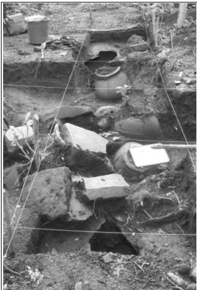
Figure 8. Area 3b, El Rayo. Ten excavation units uncovering 18 complete vessels and fragmented human remains.

shape of a water bird, identified specifically as a frigate bird (Patricia Fernandez, personal communication 2009).