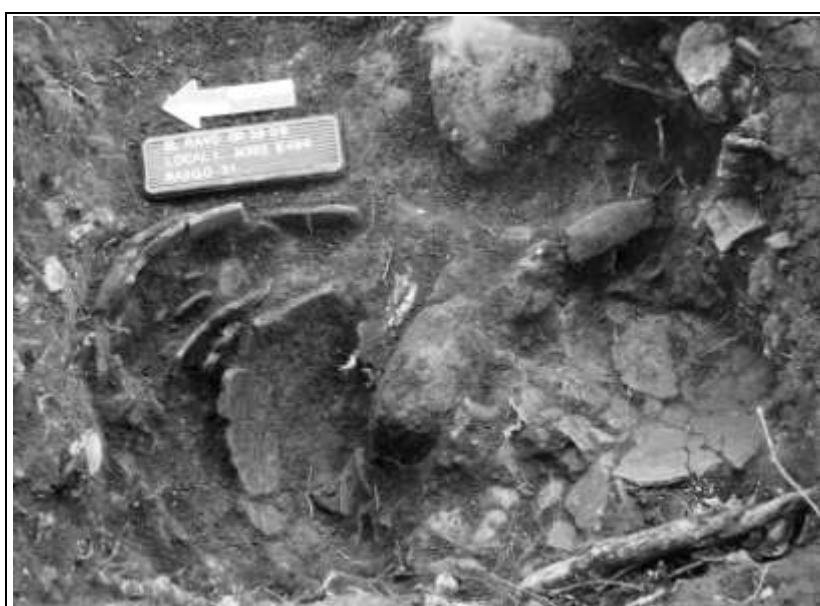
Figure 3. Area 1 Cluster 3, El Rayo. Multiple shoe pot vessels recovered in an “onion-style” deposit.

The second cluster contained four Sacasa Striated urns, a large globular olla, human remains, and a cache of prestige goods. The cache consisted of four finely-worked lithic points or knife blades, two large ear spools, and a basalt core (Figure 2). Associated with this cache was a human cranium as well as one-hundred and forty-one ceramic beads. The beads were found in three levels below a small bowl on its side; likely the original receptacle of these prestige goods. Other human remains were recovered from these units but were not in close association with this cache. Thirty-five complete ceramic net sinkers were found with this cluster. This is an unusually high concentration when compared to the rest of the area and suggests that a fishing net may have been included in the burial offerings.