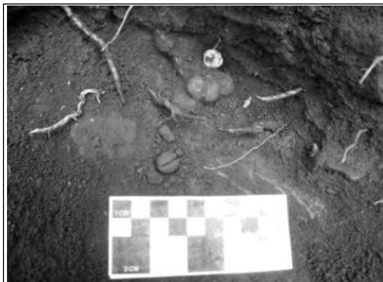
Figure 7. Area 3a, El Rayo. Offering cluster consisting of a human molar, figuring fragment and a copper bell.

Area 3a has a pattern substantially different from Area 1 in that no complete Sacasa Striated vessels were found in association with the secondary burials. Complete vessels were found in the uppermost and lowest levels of the excavation pit. A significant offering was found with three components. The first consisted of a miniature bowl covered with an inverted cup. The second included a human molar, a ceramic foot of a bird figurine, and most importantly, a copper bell (Figure 7). The third component was a complete bowl. This copper bell is the first one to be found in Nicaragua in an archaeological context. Bells are more commonly