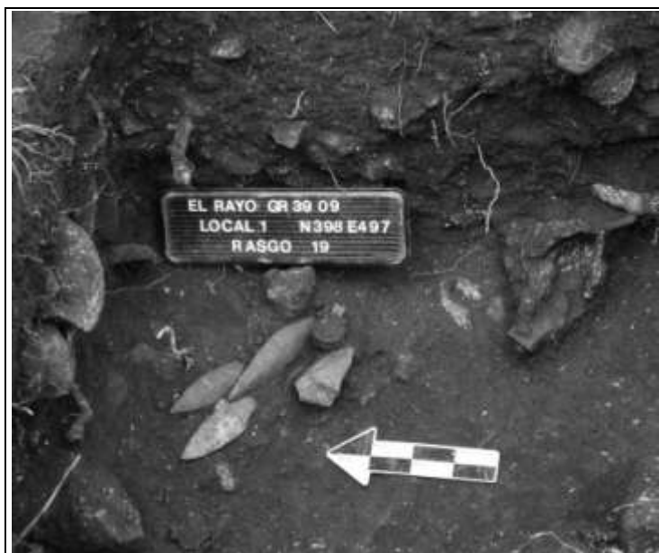
Figure 2. Area 1 Cluster 2, El Rayo. Cache of luxury goods associated with human remains.

A surprising trend from the urns at Area 1 was seen in the contents of the vessels. Expecting to find human remains, personal adornments and offerings, we were surprised to find few human remains and almost no adornments within the vessels. The most common artifacts found were smaller vessels which were placed within the shoe pot at the time of deposition. The Sacasa Striated vessels often appeared to be lined with broken pottery and contained large volcanic rocks, numbering anywhere from twenty to fifty within a vessel. While the shoe pots contained few luxury goods or human remains, both were recovered from the areas surrounding the shoe pots. Generally lithic and faunal materials were lacking from Area 1, especially when compared to the domestic area excavated at Area 2, while ceramics were abundant in all areas.