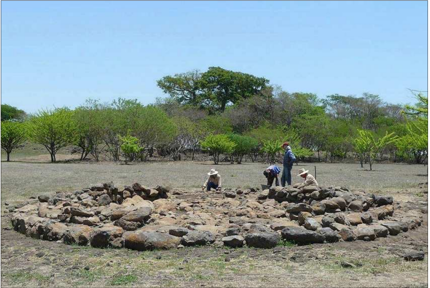
Fig. 11. P-28 has now been conserved, a necessary step in a public park with many visitors, and is integrated into the Interpretative Trail. In this view looking east workmen do the final touches of consolidation.

We also cannot be sure of the intended final form of P-28, given its unfinished state at the time of the burning of Cihuatán. As it stands, it appears to have had a large fan shaped entrance, perhaps the base for projecting stairs in the manner of Late Postclassic structures, facing towards the east, but not quite aligned with the main stair of the main pyramid P-7. Pollock (1936:160) remarks that temples to the wind god generally had their entrance facing east as this was the direction associated with Ehécatl-Quetzalcóatl . However, P-28 apparently also had a rear entrance, a feature not seen on any of the round buildings illustrated by Pollock or, indeed, seen in the excavated round structures known from Postclassic Mexico. Some sort of entrance on the west was clearly intended, as the semi-circular platform walls have an opening the same width as the narrow upper end of the fan-shaped entrance on the east. The western entrance, however, seems to have been a stair set into the platform. Does this indicate that P-28 was not to be a building, but rather a solid platform? If so, this opens up another very possible function, that of a gladiatorial platform.