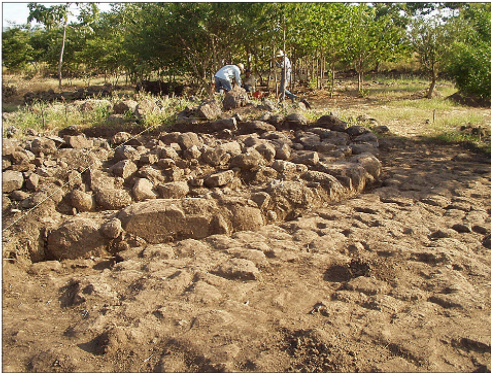
Fig. 2. P-28 during excavation. The round shape is clear, but the platform had been used (by park workmen) to throw loose rocks upon, resulting in a loose pile of unassociated stone covering part of the platform.

covered with an enormous elite residential/religious/governmental complex. The Acropolis is currently under excavation and will be the subject of a later publication.