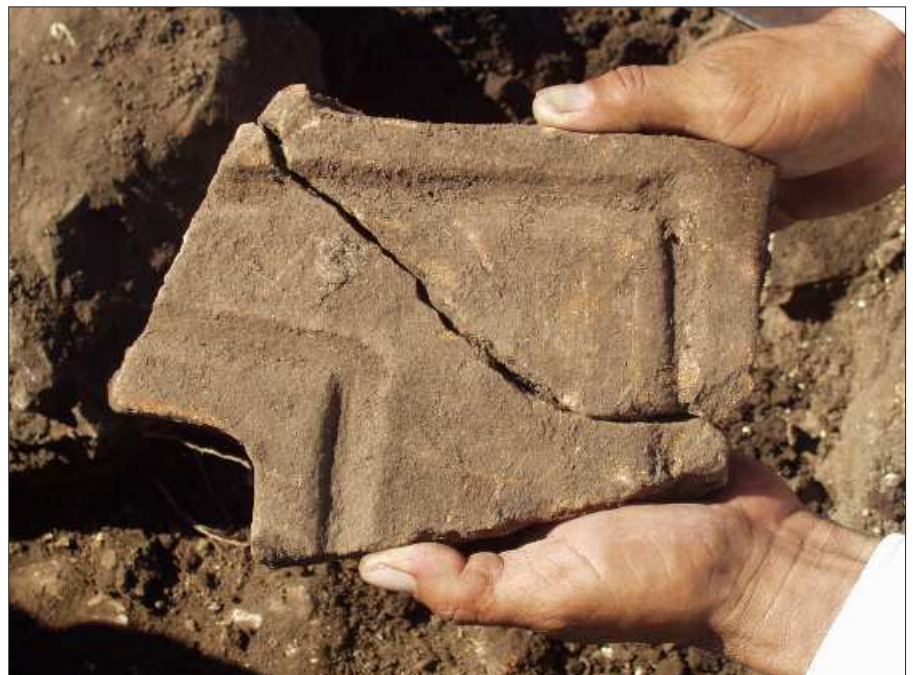
Fig. 8. A fragmentary almena recovered from amidst the rock fill of P-28.

Since round structures in El Salvador are so poorly known we have no comparative material to help in the identification of this enigmatic structure. Certainly in Late Postclassic central and Gulf Coast Mexico, if not elsewhere, round temples were commonly associated with Ehécatl-Quetzalcóatl. It is also the case that Gulf Coast influence is manifest both at Cihuatán and at earlier sites in El Salvador (cf. Andrews 1971; Boggs 1950, 1972; Casasola 1976-77, Bruhns 1980 inter alia ). However, not all round temples were wind god temples, to judge from the number of round or partly round structures—and their diversity—found in Mexico and the Maya area from the Preclassic onwards. Pollock notes that in the Late Postclassic the chroniclers Motolinia and Torquemada both mention that not all round structures were dedicated to Ehécatl-Quetzalcóatl, but that “other gods” were also worshipped in them (Pollock 1936:32). It is possible that there may not have been such a strong identification of round structures with a specific (Mexican) deity in the Maya area. The well known Caracol, or Observatory, at Chichén Itzá is, of course, a good example of a round structure which probably was not a Wind God