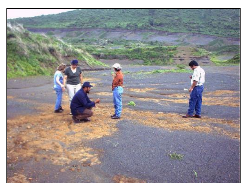
Figure 2. The archaeological surface with volcanic sand layer in profile behind (McCafferty 2009).

Located at the base of the Nejapa-Miraflores volcanic alignment (a series of fissure vents) on the northwest side of modern day Managua City the site of La Arenera, which literally translates to "the sand quarry," covers an area ranging somewhere between 40 hectares and 1 km<sup>2</sup> (McCafferty 2009; McCafferty and Salgado 2000). A preliminary evaluation of the site conducted in 2000 led by Geoff McCafferty and Silvia Salgado Gonzalez identified a well-preserved Tempisque period—or La Colonia phase (500 B.C.-A.D. 300) in the local Managua chronology—occupation buried beneath layers of volcanic sand and/or debris (Figure 2). This temporal placement is identified by diagnostic Tempisque ceramic types including negative resist painted Usulutan-like wares, Rosales Zoned Engraved, and Obanda Black-on-Red. Also present in the excavations were obsidian materials—possibly from the Guinope source in Honduras. It may be that earlier occupations exist at La Arenera but the brevity of excavations in 2000 did not permit deeper stratigraphic exploration. Above the layers of volcanic sand is evidence of final reoccupation dating to approximately A.D. 1–300. However, ceramics discovered within the occupational level also include traces of diagnostic Bagaces period (A.D. 250–800) ceramics including Chavez White-on-Red (McCafferty and Salgado 2000) which may suggest a slightly longer and more recent extension of the occupational sequence.