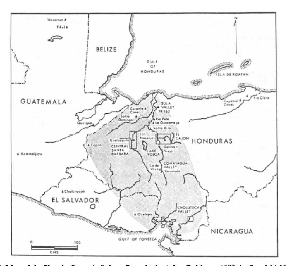
Figure 6. Map of the Uapala Ceramic Sphere Boundaries (after Robinson 1988, in Goralski 2008:1992)

(Cognato 2008; Goralski 2008:255). For example, at the site of El Guayabal in the Paraíso Valley of Honduras, researchers have discovered locally-produced Izalco-style Usulutan and imports from the Copan Valley and other places<sup>7</sup> (Cagnato 2008:68).