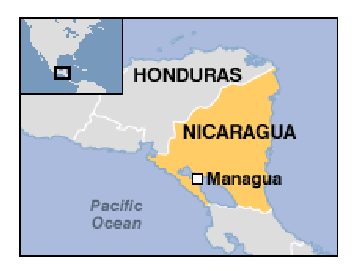
Figure 1. Location of Managua City, Nicaragua.

Our presentation begins with a brief overview of the site itself, including the sample selected for presentation. This is followed by a more technical look at the method, results, and interpretation of the compositional analyses. In the final discussion we undertake a cursory overview of Usulutan ceramic production at an interregional level, situate our sample in relation to this data, and begin to formulate potential sociocultural interpretations for the trends we are seeing at La Arenera.